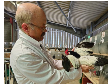
Judge Wayne Parfitt