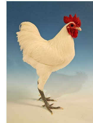
Left. Reserve Show Champion— Black Red Modern Game bantam. Right. Best Bantam Softfeather Heavy— White German Langshan. Both Exhibited by B & C Ward